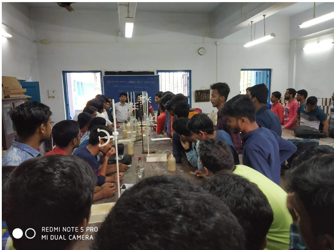
Few moments of the Workshop